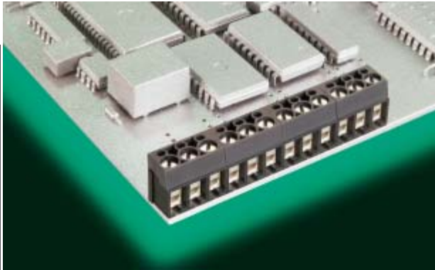
AK 100/.. DS - 5,0 - V - grey

2-12 poles, Spacing 5,0 mm insert required no. of poles ..