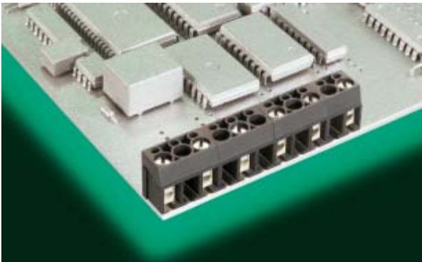
AK 100/.. DS - 10,0 - V - grey

2-12 poles, Spacing 10,0 mm insert required no. of poles ..