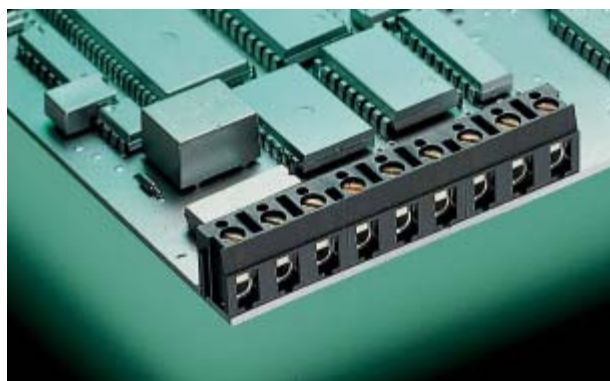
AK 110/.. DS - 7,5 - V - grey

2-12 poles, Spacing 7,5 mm insert required no. of poles ..