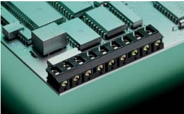
AK 110/.. DS - 7,5 - H - grey

2-12 poles, Spacing 7,5 mm insert required no. of poles ..