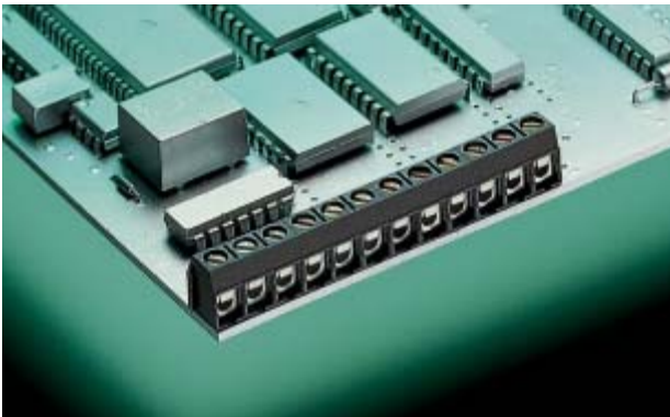
AK(Z) 500/.. DS - 5,0 (5,08) - V - grey

2-12 poles, Spacing 5,0 mm or 5,08 mm insert required no. of poles ..