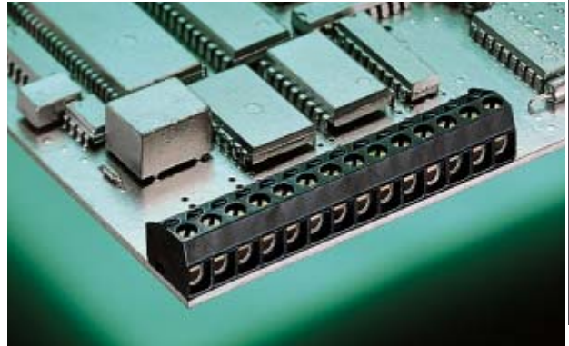
AK(Z) 130/.. - 5,0 (5,08) - grey - BL

2-16 poles, Spacing 5,0 mm or 5,08 mm insert required no. of poles ..