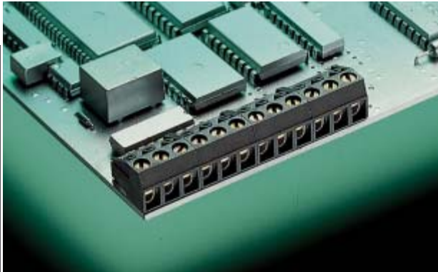
AK 130/.. - 5,0 - grey

2-12 poles, Spacing 5,0 mm insert required no. of poles ..