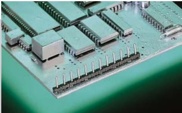
STL 132/.. - 5,0 - V - black

2-24 poles, Spacing 5,0 mm insert required no. of poles ..